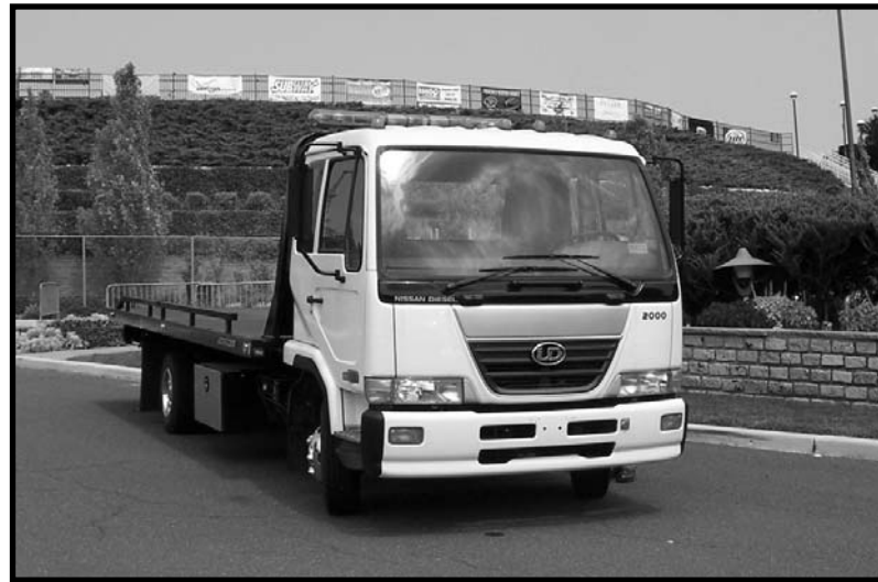
*UD2000 shown here with dealer installed optional equipment.