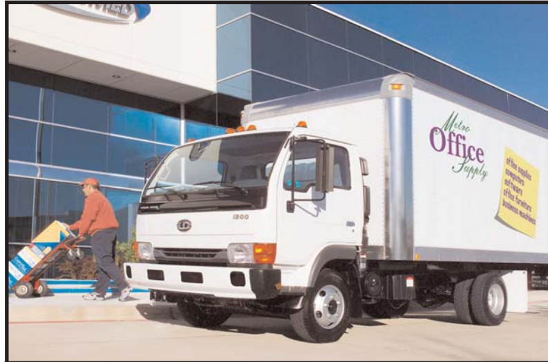
*UD1300 shown here with dealer installed optional equipment.